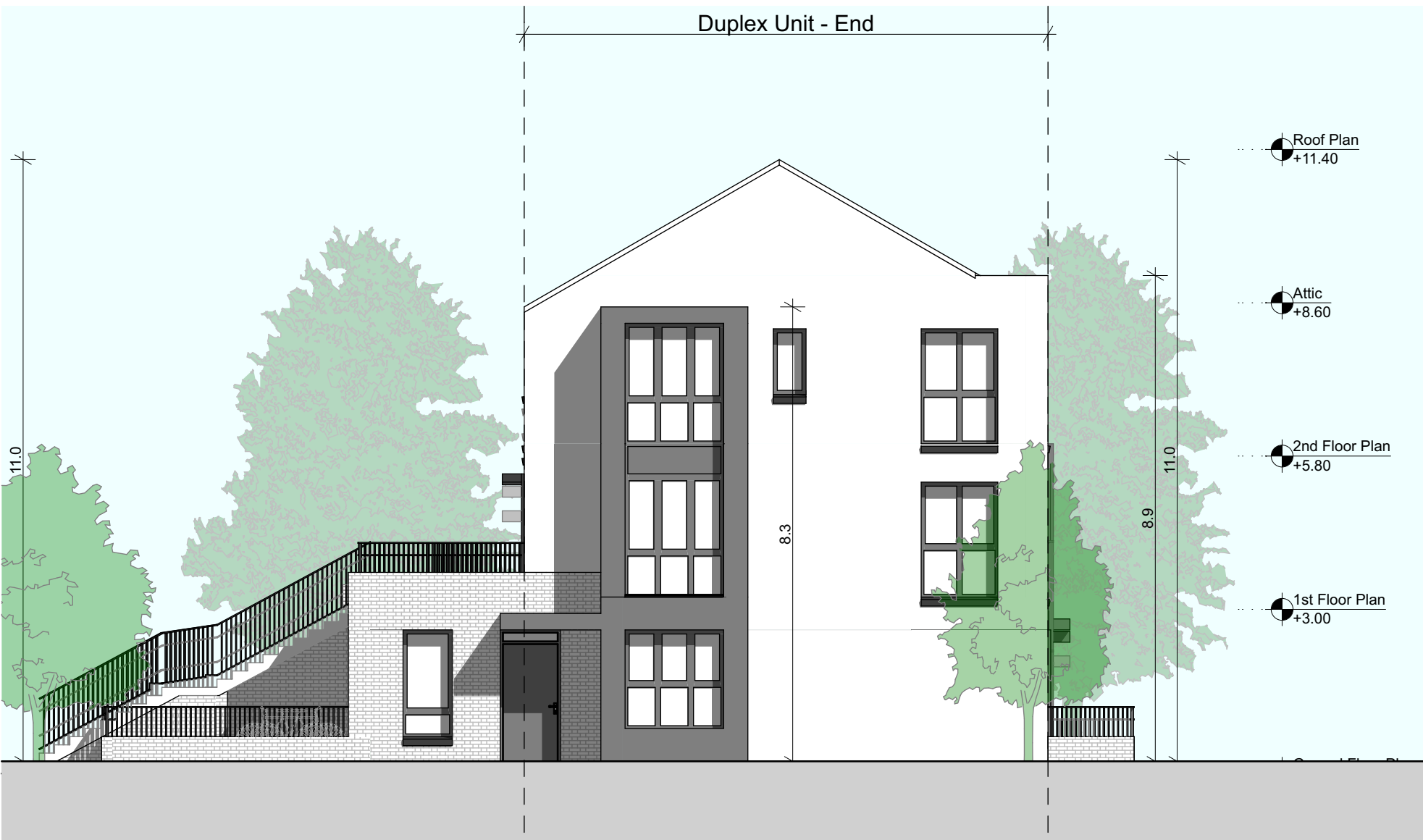
SIDE ELEVATION 01 SCALE 1:100