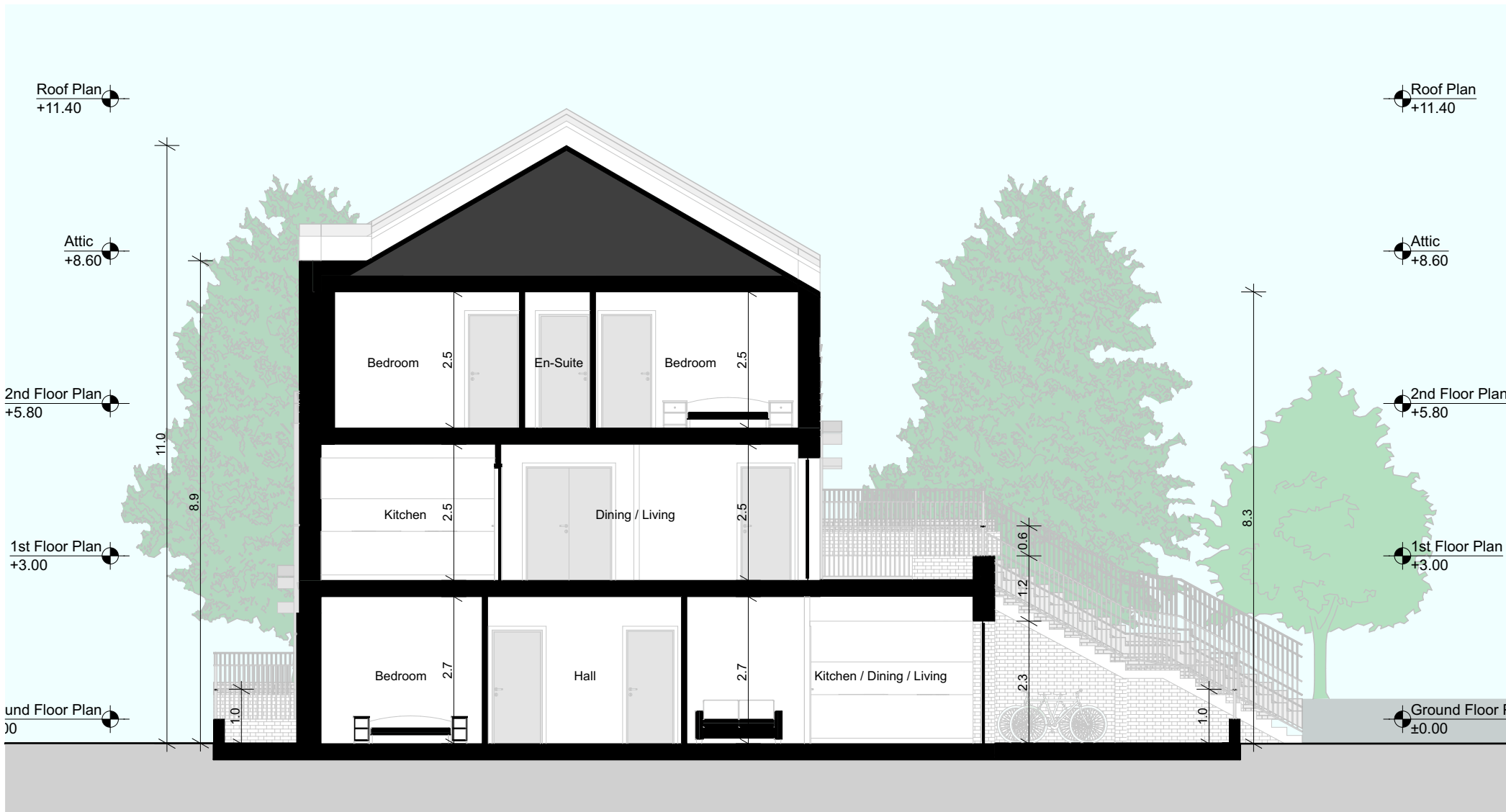
SECTION 01 SCALE 1:100