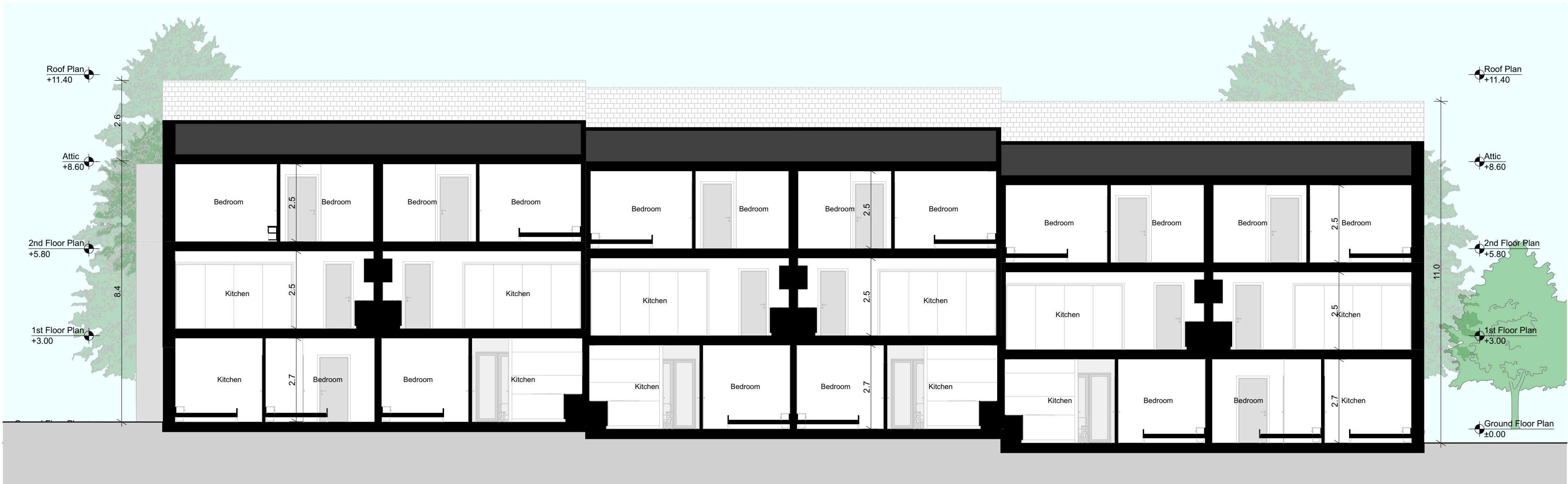
SECTION 02 SCALE 1:100